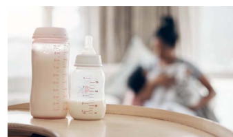
Child Safety Products Manufacturer

Products include infant feeding bottles, bath mats, outlet plugs, and appliance guards Gross Receipts $1.5M