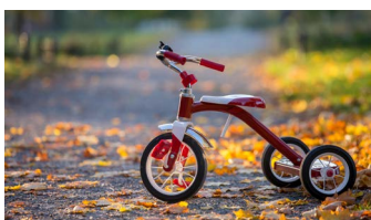
Importer of Plastic Ride-On Toys

Products include training trikes, bikes, and pedal go-karts