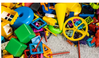
Manufacturer of Children's Promotional Items

Products designed for children aged infant to pre-school Primary and Excess Policies Gross Receipts: $2M