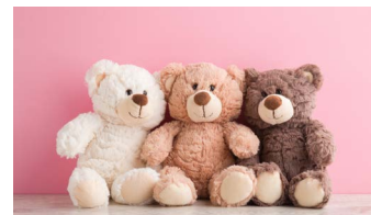
Manufacturer of Plush Toys

Products include small plastic toys, place mats and other promotional items for children's restaurants and meals Gross Receipts: $5M