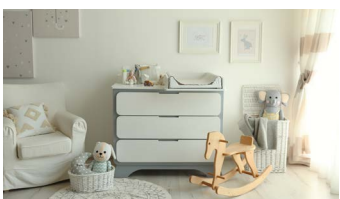
Infant Furniture Manufacturer

$5M Excess over Primary GL, HNOA, EL, and EBL policies Gross Receipts: $30M